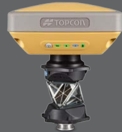
HIPer SR with prism